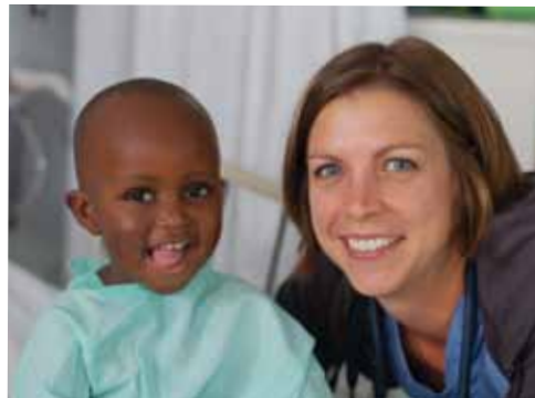
A member of the U.S. team with a patient.