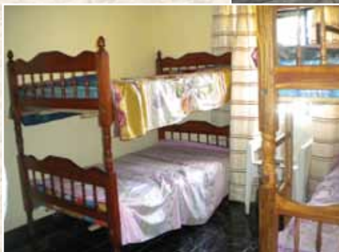
One of the Center's bedrooms.