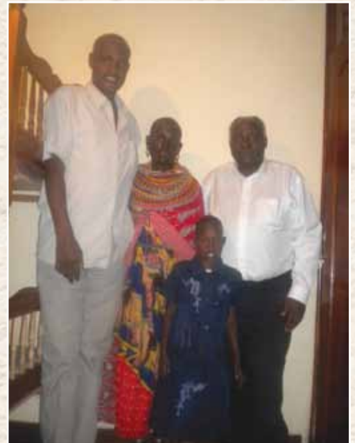
One of the many families who stayed at the Center.