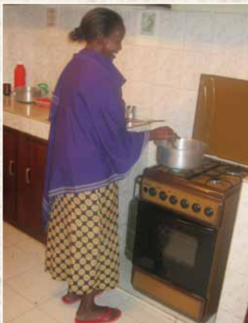
A mother preparing food for her family in the Center's kitchen.