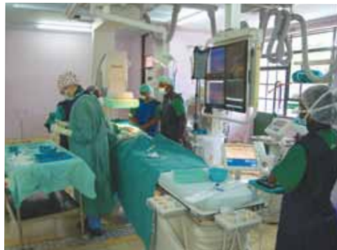
Mater Hospital's new operating room